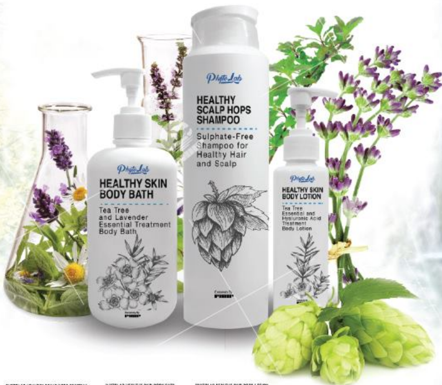
PHYTOLAB HEALTHY SCALP HOPS SHAMPOO